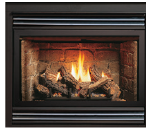
Unit illustrated is a ZV3600N Zero Clearance Vented Fireplace – Natural Gas, with LOGC44, Z36GBC Grills Classic Chrome, and a Z36RL Brick Liner.

Choose from our LOGC42 Classic Oak Four Piece, LOGC43 Traditional Oak Four Piece or LOGC44 Burnt Oak Eight Piece