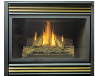
Unit illustrated is a ZV3600N Zero Clearance Vented Fireplace – Natural Gas, with LOGC42, Z36GBP Grills Classic Polish Brass.