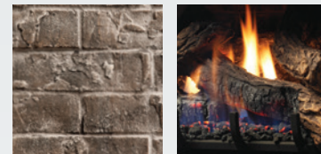
IDV26RL Traditional Brick Liner