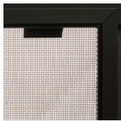
Safety Screen Barrier