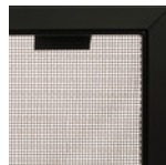
Safety Screen Barrier