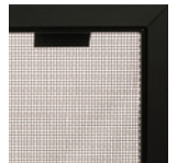
Safety Screen Barrier