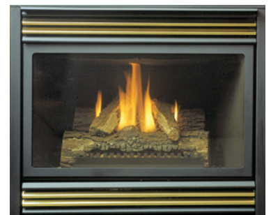
Model ZV3600N Zero Clearance Vented Fireplace – Natural Gas, with LOGC42, Z36GBP – Grills Classic Polish Brass.