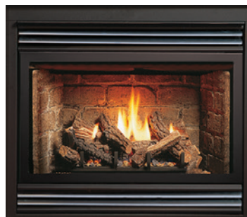
Model ZV3600N Zero Clearance Vented Fireplace – Natural Gas, with LOGC44, Z36GBC Grills Classic Chrome, and a Z36RL Brick Liner.