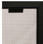
Safety Screen Barrier