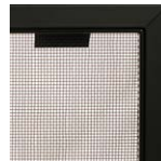
Safety Screen Barrier