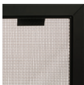
Safety Screen Barrier