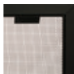
Safety Screen Barrier