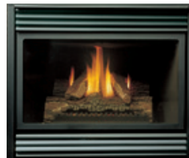
Model ZV3600N Zero Clearance Vented Fireplace – Natural Gas, with LOGC42, Z1GBL Grills – Black.