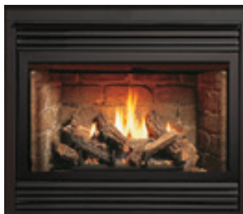
Model ZV3600N Zero Clearance Vented Fireplace – Natural Gas, with LOGC44, Z1GBL Grills – Black, Z36RL Brick Liner.