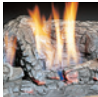
Fibre Oak Log Set