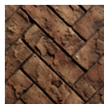
Herringbone Brick Liner RLH