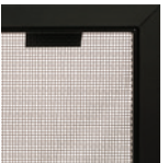
Safety Screen Barrier