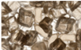
1/2" Bronze (5 lbs)

REQUIRED: 5 lbs per foot of burner (ie: 24" burner = 10 lbs)