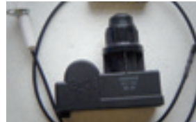
AAA Battery not included.