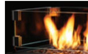
5 1/2" Height

OB24WG (24" Burners OB24) OB36WG (36" Burners OB36) OB48WG (48" Burners OB48) OB72WG (72" Burners OB72) OB96WG (96" Burners OB96)