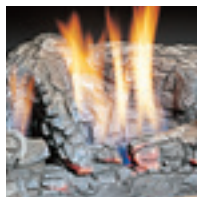
Fibre Oak Log Set