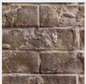
MP42RLT Traditional Brick Liner