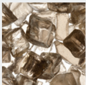
MQG5C Decorative Ember Glass