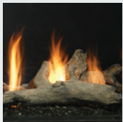
M42LOG3 Driftwood Log Set