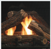
M42LOG4 Oak Log Set