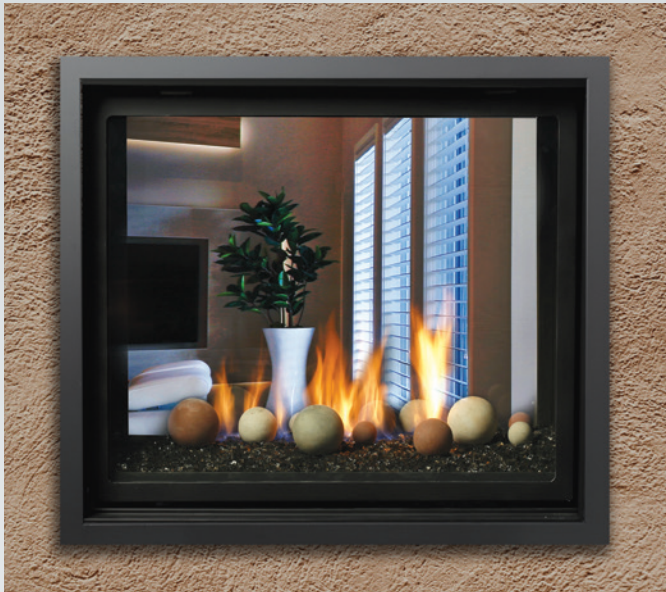
Model MCVST42NH See-Through Fireplace – Natural Gas, ZCV42S2PFBLSurround Picture Frame 1 5/8" Wide, MST42GT Glass Tray, ZG5C Glass Media – Bronze x (5), RBCB1 Cannonballs, MST42PL Porcelain Liner.