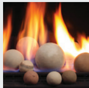
RBCB1 Multi-colored Cannonballs