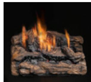
LOGF18 Log Set

The ultimate in Zero Clearance Vent-Free Fireplaces for new home construction or renovation, and your best choice for installation anywhere throughout your home.