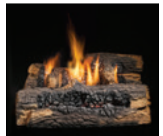
LOGF24 Log Set