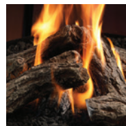
LOGC86 5-Piece Oak Log Set