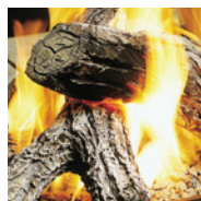
LOGC85 4-Piece Oak Log Set