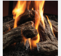
LOGC86 5-Piece Oak Log Set