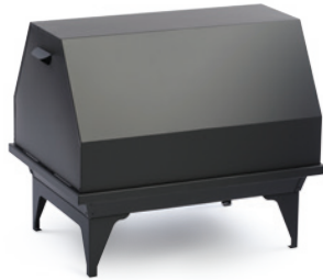
FP27COV Fire Pit Cover (for use with Log Set) – Optional.