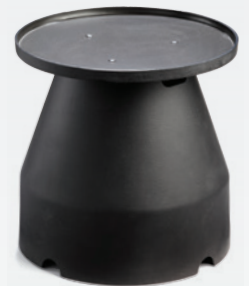
FP20COV Table Top Cover for Round Fire Pit.