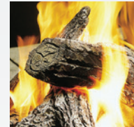
LOGC85 4-Piece Oak Log Set