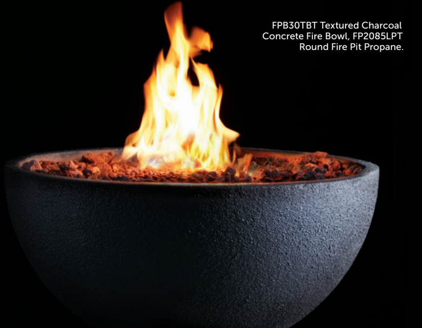
FPB30TBT Textured Charcoal Concrete Fire Bowl, FP2085LPT Round Fire Pit Propane.