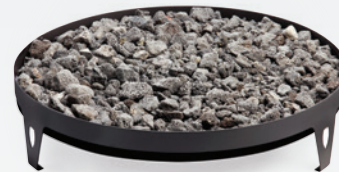
FP2085NT Round Fire Pit Shown With Lava Rock.