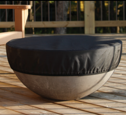
FPB30COVB Fire Bowl Cover – Optional.