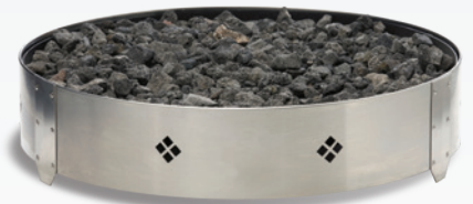
FP2085NT Round Outdoor Gas Fire Pit – Natural Gas, FP20SSRT Stainless Steel Ring.