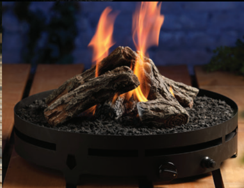
FP2085LPT Fire Pit – Propane, LOGC86 Log Set.