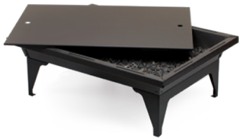
FP2785LPT-FL Rectangle Fire Pit – Propane, with Flat Cover.