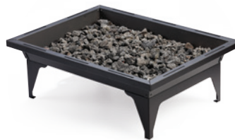
FP2785 Rectangular Fire Pit – Shown With Lava Rock.