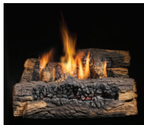
LOGF24 Log Set