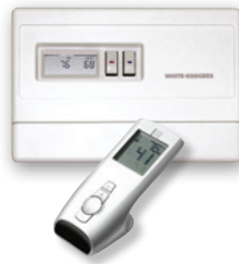
PF1 or MV