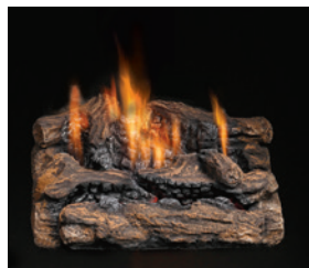
LOGF18 Log Set