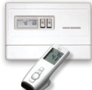
PF1 or MV

FOR CALIFORNIA RESIDENTS ONLY: WARNING! This product can expose you to chemicals including Carbon Monoxide, that is an externally vented by-product of fuel consumption, which is [are] known to the State of California to cause birth defects or other reproductive harm. For more information, visit www.P65Warnings.ca.gov .