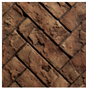
Herringbone Brick Liner RLH