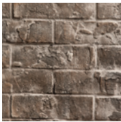
Traditional Brick Liner RLT

On/Off, Thermostat on/off, Thermostat On/Off modulating,