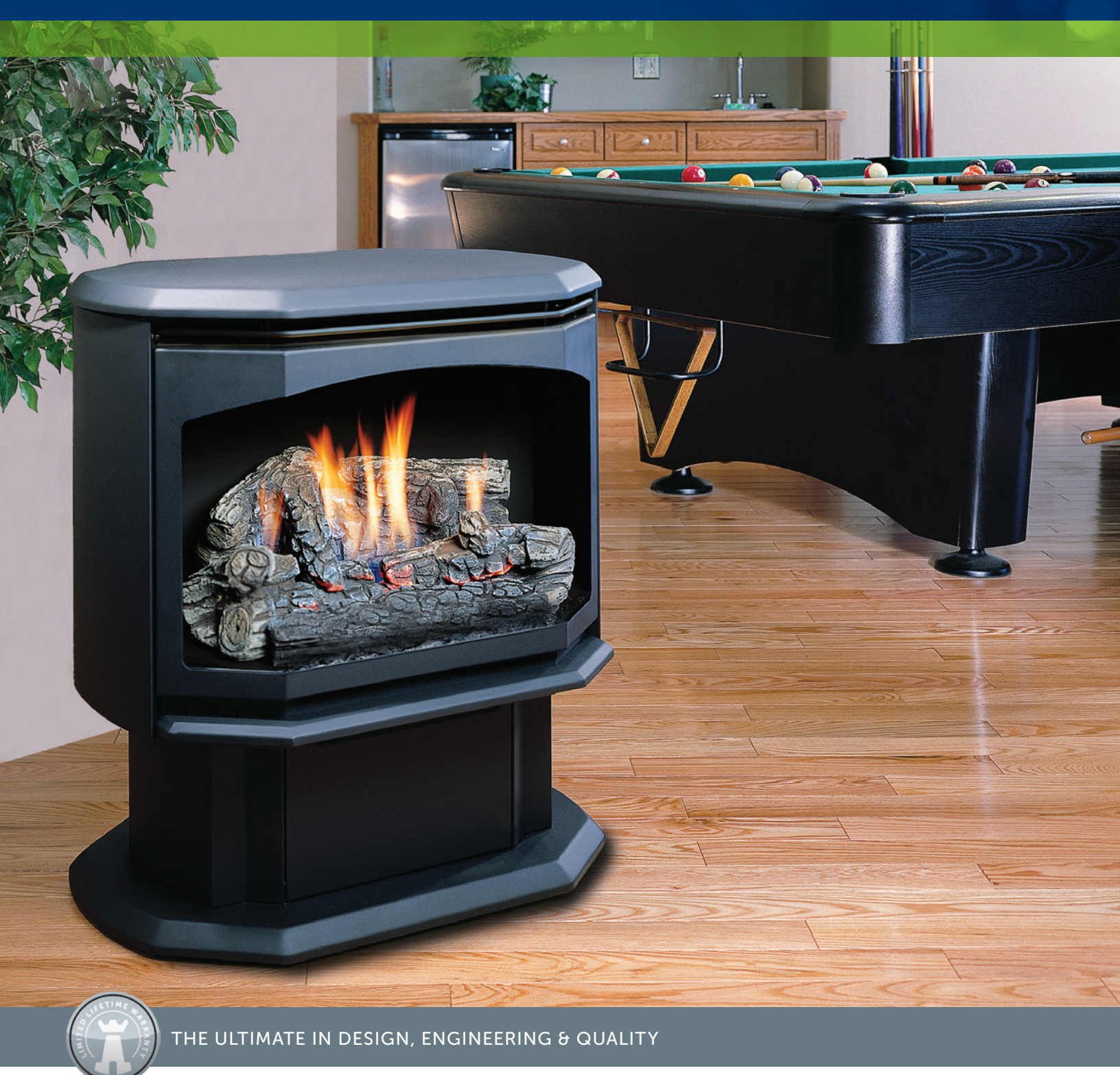
FVF350 VENT FREE FREESTANDING GAS STOVE

Vent Free appliances can only be installed in some areas of the United States.