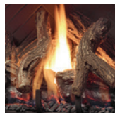
LOGF36 Split Oak