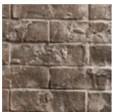
RLT Brick Liner Traditional