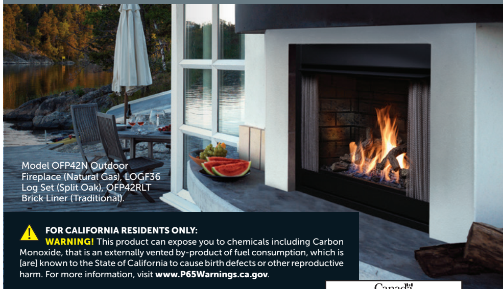
Model OFP42N Outdoor Fireplace (Natural Gas), LOGF36 Log Set (Split Oak), OFP42RLT Brick Liner (Traditional).

! FOR CALIFORNIA RESIDENTS ONLY: WARNING! This product can expose you to chemicals including Carbon Monoxide, that is an externally vented by-product of fuel consumption, which is [are] known to the State of California to cause birth defects or other reproductive harm. For more information, visit www.P65Warnings.ca.gov .