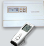
PF1 or MV