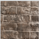
Traditional Brick Liner RLT