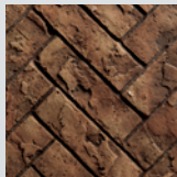
Herringbone Brick Liner RLH