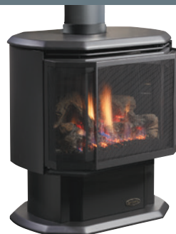
Safety Screen Barrier

FOR CALIFORNIA RESIDENTS ONLY: WARNING! This product can expose you to chemicals including Carbon Monoxide, that is an externally vented by-product of fuel consumption, which is [are] known to the State of California to cause birth defects or other reproductive harm. For more information, visit www.P65Warnings.ca.gov .